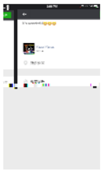
Share & Display