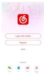
Login & Register